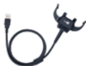
USB snap-on Cable